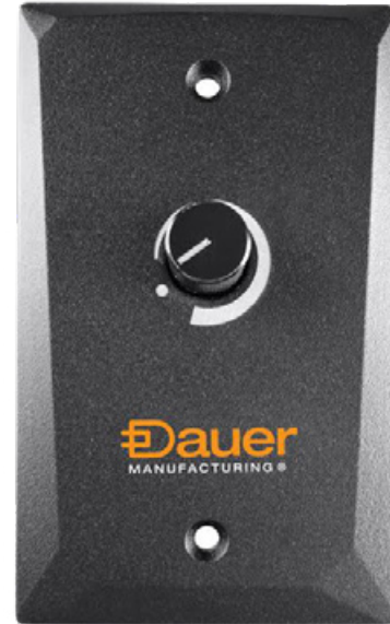
High efficiency digital dimmer.