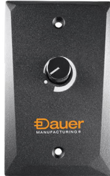
High efficiency digital dimmer.