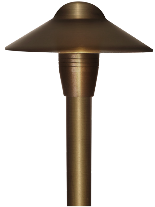
The Windsor path light features a 6" diameter cast brass hat. Its underside is a powder-coated reflective white surface.