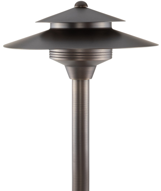
The Andros path light features an 8.5" diameter cast brass hat. Its underside is a powder-coated reflective white surface.