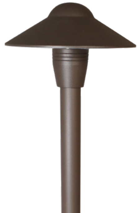
The Antigua path light features a 6" diameter cast aluminum hat. Its underside is a powder-coated reflective white surface.