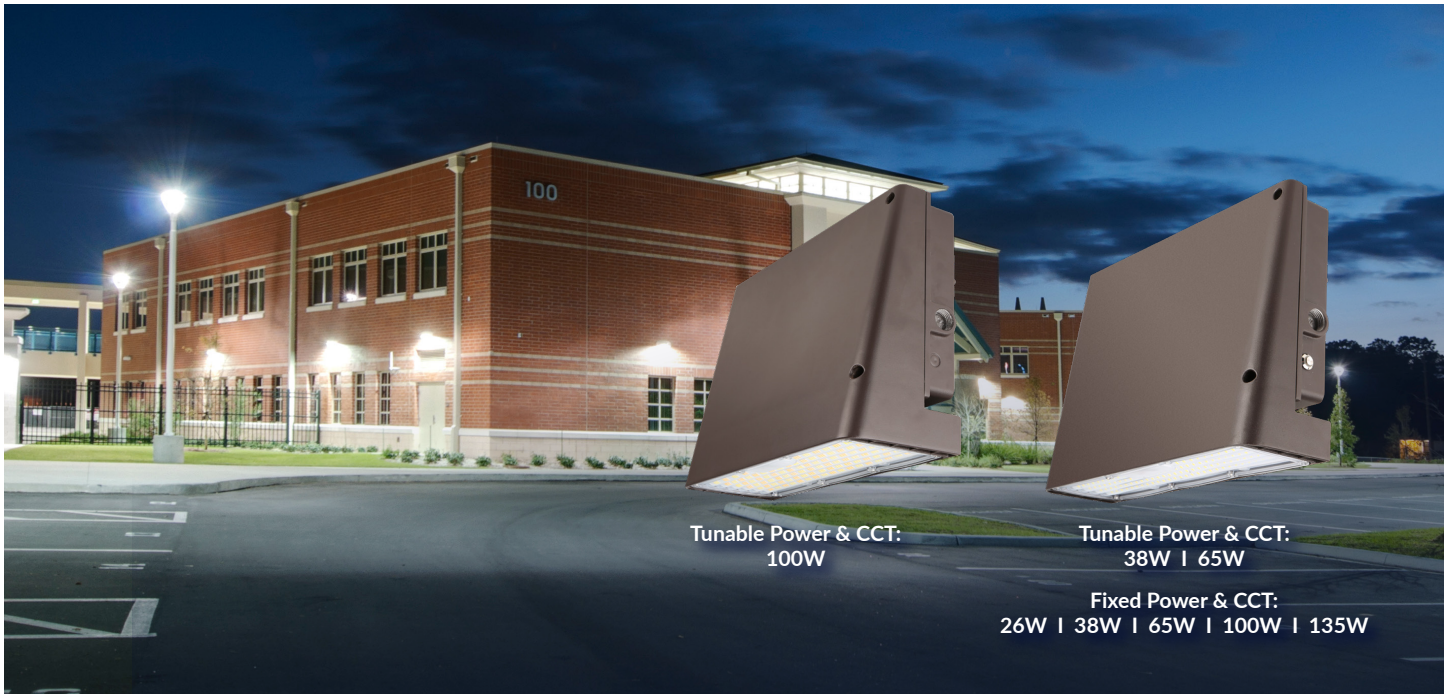
Tunable Power & CCT: 100W