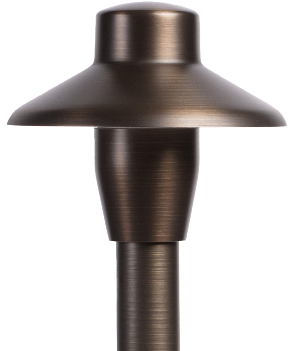
The Dharma path light features an 4" diameter cast brass hat. Its underside is a powder-coated reflective white surface.